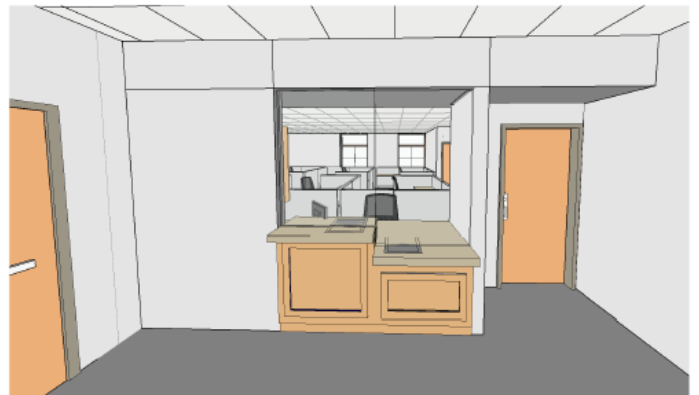
2 RECEPTION/WAITING COLORS NOT ACCURATE - SHOWN FOR MATERIAL REFERENCE ONLY

View of the Reception Counter from the Public Reception/Waiting Area