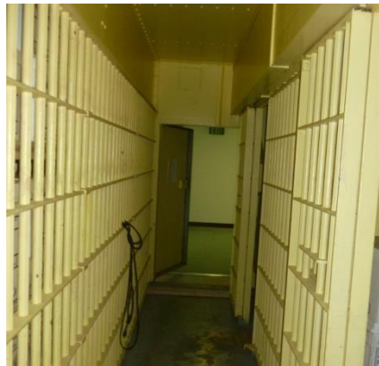
Old County Jail